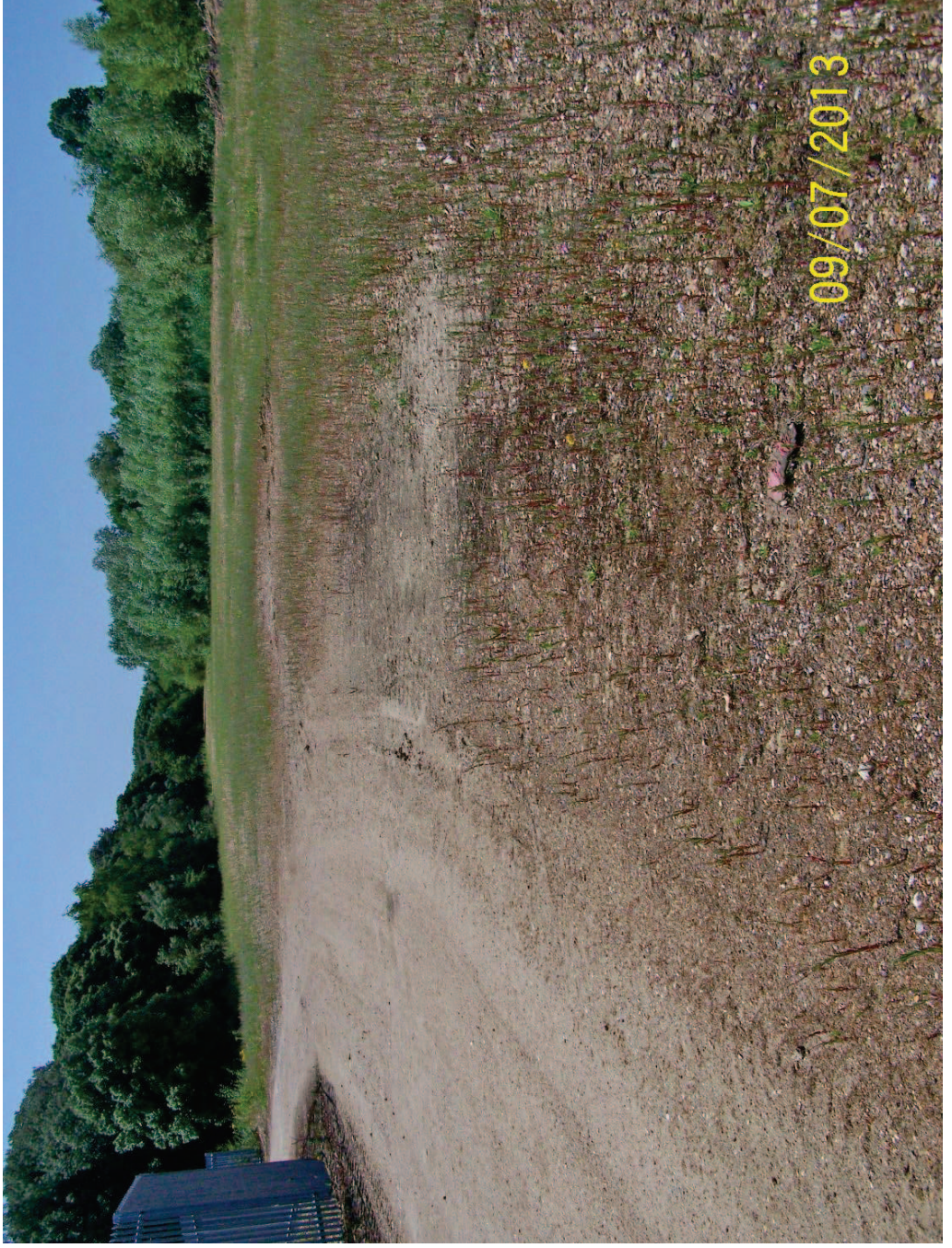
Figure 2 :View looking east towards the Ashford Road of land in the southern part of Queen Mary Quarry showing proposed conveyor route and existing vegetation habitat