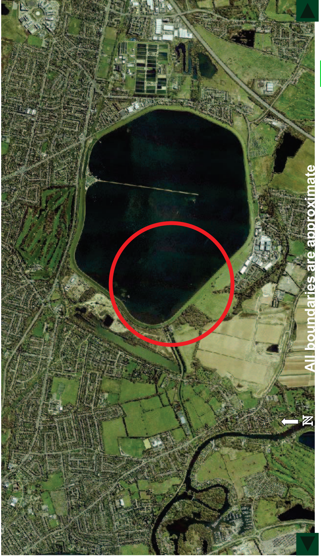
Aerial 1 : Land at Queen Mary Quarry